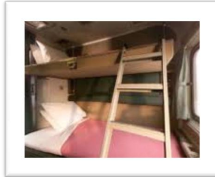
The Superliner Family Bedroom in night mode.