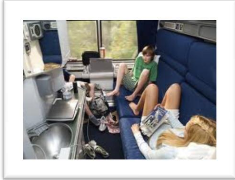
The Viewliner Bedroom in day seating mode.

The Viewliner Bedroom is ideal for two passengers, but can accommodate three (two passengers must share the lower berth). Please call us if you wish to reserve three passengers. The Viewliner Bedroom is a step up from the Viewliner Roomette, and offers a private, self-enclosed toilet and shower in the cabin. Like the Roomette, the Bedroom has comfortable reclining seats on either side of a sweeping picture window. At night, the seats convert to a bed, and an upper berth with its own picture window folds out from the upper wall.